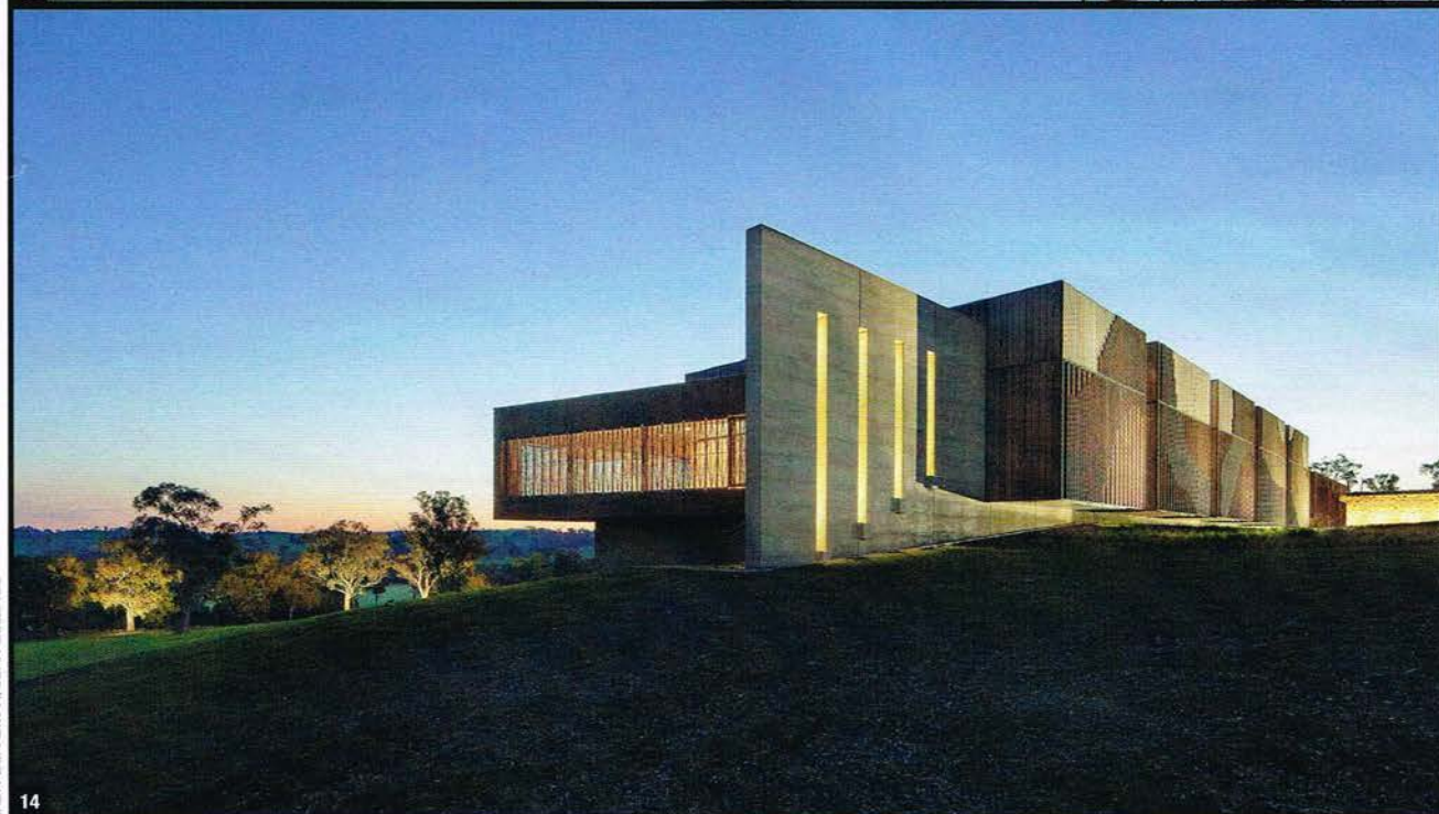
BRITT BOARDMAN, JOHN COLLINGS

The design brief for this private art gallery in outback NSW was very simple: a gallery for 100 Australian artworks and a table to entertain 100 dinner guests. The architects used rammed earth, stone, steel and recycled timber when constructing the building. Five gallery spaces were conceived as "metaphors for caves where Aboriginal art was first created", according to the entry. "They represent time, place, artist, material and meaning." The charcoal grey walls allow the vibrant tones of the indigenous art to stand out. "Garangula Gallery is a truly remarkable experience: it creates a sense of occasion, functionally and metaphorically, and is a place that celebrates Australian art and landscape," the jury notes.