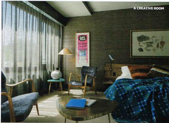
A CREATIVE ROOM