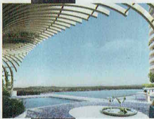
Geocoon's planned residential towers in Belconnen, top; and the view from Infinity Towers in Gungahlin

major road gateway to the city – will prompt new development and housing along the route. The government is part-funding the project by selling off public buildings along the route, which Barr expects to be used for eight to 10-storey residential projects.