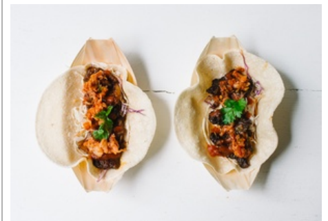
A Korean Twist on Mexican Street Food Ko & Co breaks onto the Surry Hills scene with something a little outside the norm.