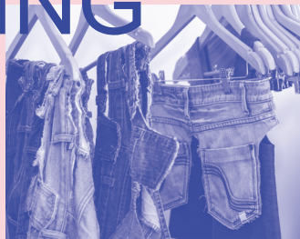
REVIVE THE OLD