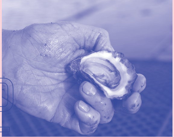
SHUCK LIKE A PRO