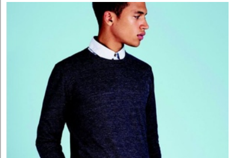
A.P.C. Opens First Australian Store in Melbourne The French label renowned for its workwear-inspired designs and clean lines is opening its first Australian store in Melbourne tomorrow.