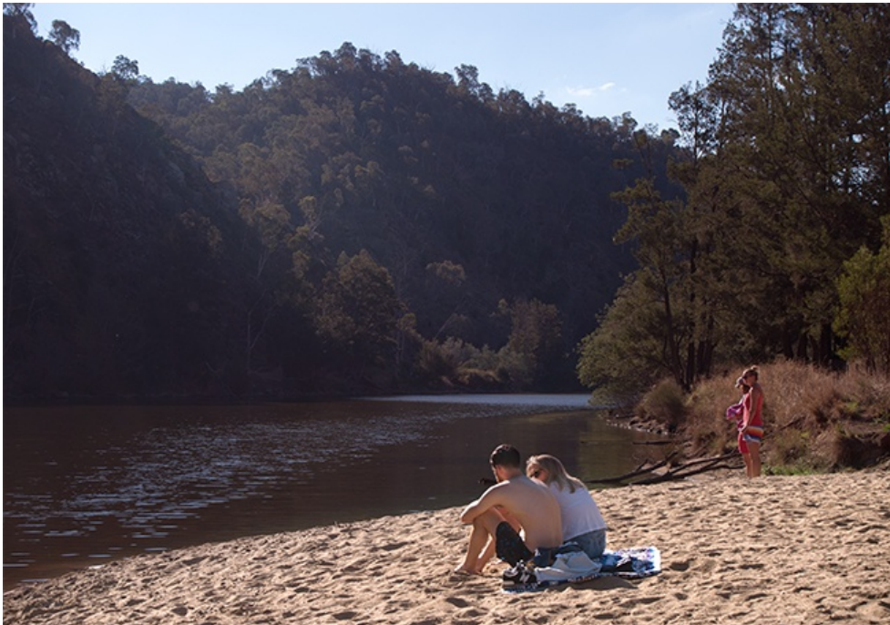
Kambah Pools