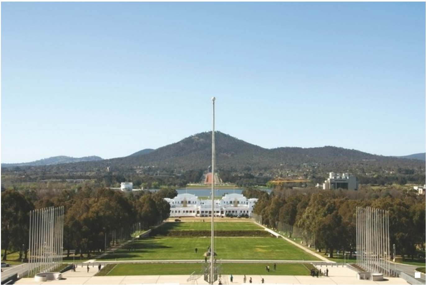
Parliament House and the Australian War Memorial, which are among the main attractions in Canberra, Australia.