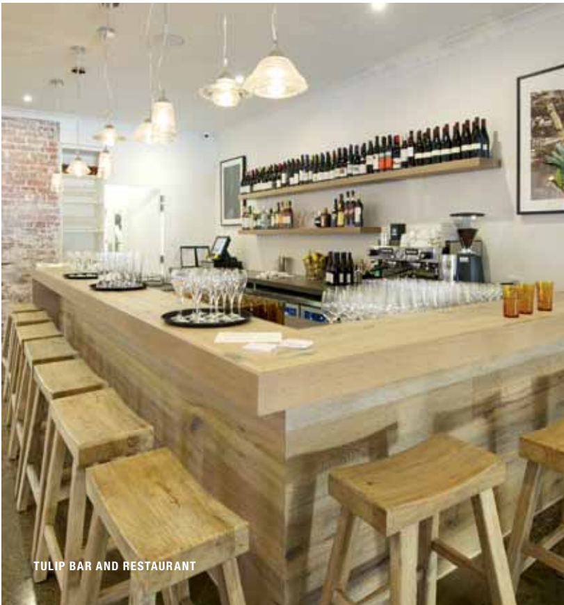
TULIP BAR AND RESTAURANT