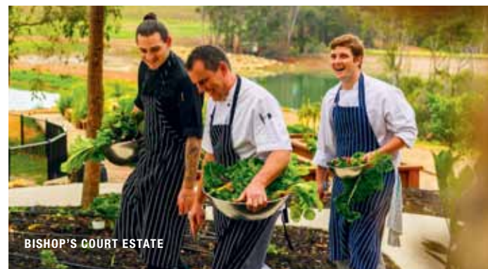
BISHOP'S COURT ESTATE