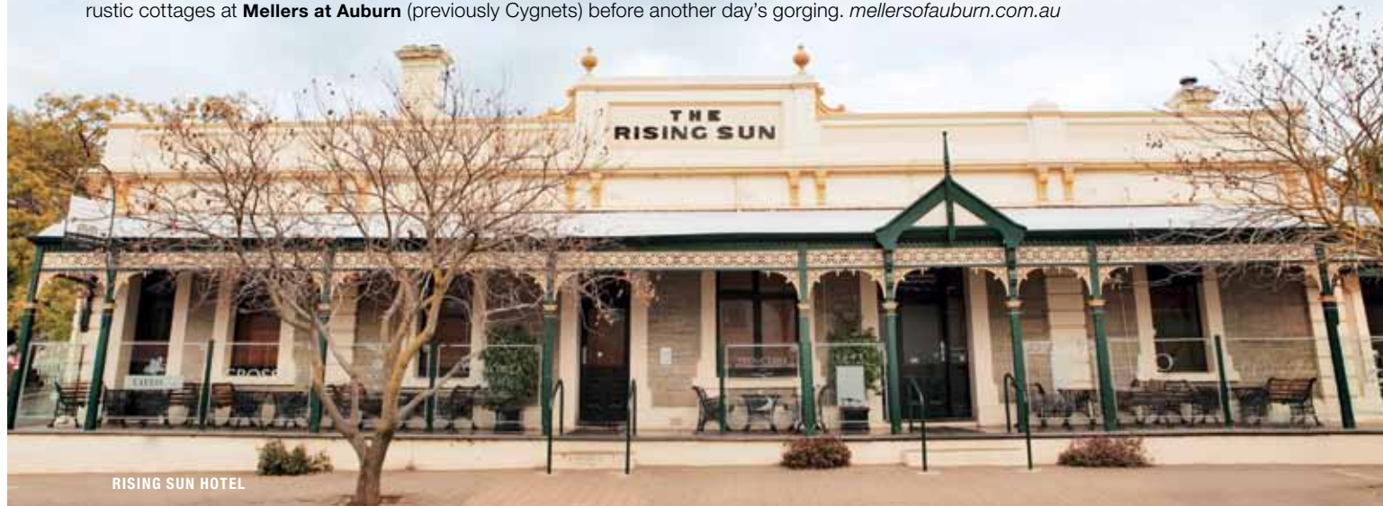
RISING SUN HOTEL

It may only be a tiny speck on the map, but the hamlet of Auburn in Clare Valley punches well above its weight in the gourmet stakes. The new Clare Valley Brewing Co tasting room offers a range of local beers and ciders on tap, as well as wines from Jeanneret and Good Catholic Girl , while the Grosset , Mount Horrocks and Taylors cellar doors are also worth a visit. At the new Terroir restaurant, chef Dan Moss specialises in local flavours (all ingredients are sourced within 100 miles), while you'll find some of the best pub grub in the state at revamped Rising Sun Hotel next door. Catch some shut-eye in one of the lovely, rustic cottages at Mellers at Auburn (previously Cygnets) before another day's gorging. mellersofauburn.com.au