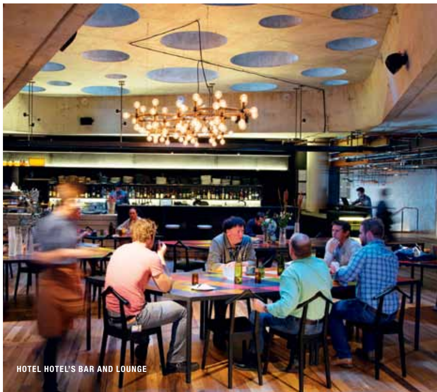
HOTEL HOTEL'S BAR AND LOUNGE