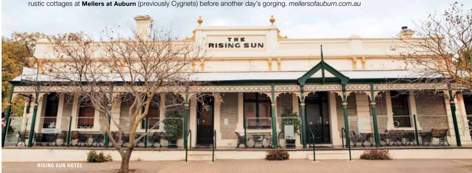
RISING SUN HOTEL

It may only be a tiny speck on the map, but the hamlet of Auburn in Clare Valley punches well above its weight in the gourmet stakes. The new Clare Valley Brewing Co tasting room offers a range of local beers and ciders on tap, as well as wines from Jeanneret and Good Catholic Girl , while the Grosset , Mount Horrocks and Taylor's cellar doors are also worth a visit. At the new Terroir restaurant, chef Dan Moss specialises in local flavours (all ingredients are sourced within 100 miles), while you'll find some of the best pub grub in the state at revamped Rising Sun Hotel next door. Catch some shut-eye in one of the lovely, rustic cottages at Mellers at Auburn (previously Cygnets) before another day's gorging. mellersofauburn.com.au