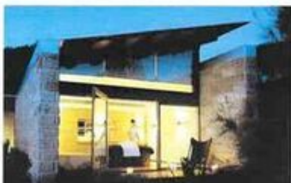
Indulgence: (Clockwise from main) Saffire Freycinet, The Old Clare Hotel, Wolgan Valley Resort & Spa, Tiwi Islands.

Not everyone can afford a luxury lodge, but increasing numbers of us are delving deeper into the continent's Indigenous cultures. Queensland, the Northern Territory and Western Australia in particular have developed an impressive portfolio of Indigenous experiences to suit every budget. Whether it is a Deviltime walk through