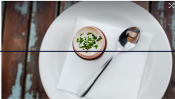
The 'Stolen' farm egg, at the revamped Pulp Kitchen at Ansell's shops.

We said hello to venues like Kokomo's, Agostinis, Olive at Hawker, Bouchon Street Kitchen, Highgate House, Courtyard by Milk Crate, Lolo and Lola, Stanley's, MOLO Live, Mookie, The Doughnut Department, The Kingston Collective, Circula Restaurant, Olleyville, The Goods Wholefoods, Capital Brewing Co brewery and taphouse, RARU, Highroad, East Street Canberra, 88mph, Podlato, Baked, Mama Dough, and Meadow amongst others.